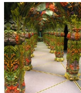
A coral reef has established itself among the ancient ruins.