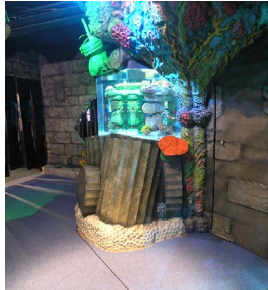
Carved Pillars and a Giant Head litter the sea floor in the sunken city of Atlantis.

Mirror mazes create seemingly endless underwater spaces. Tanks of living fish add movement and interest.