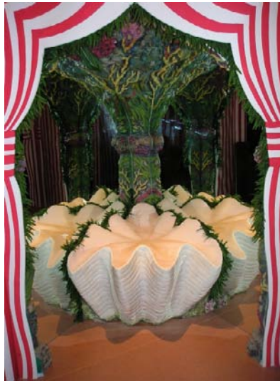
A giant seashell is the place to sit for photographs at Louis Tussauds, Blackpool, UK.

Mirror mazes can convey seemingly endless underwater spaces in natural and informal ways. Tanks of living fish add movement and interest.