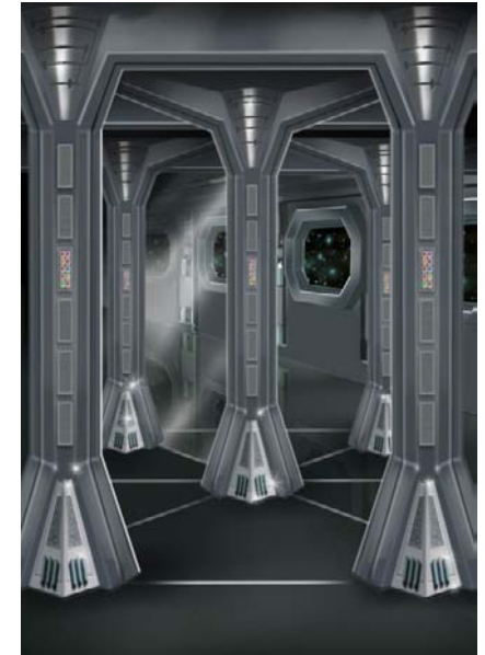
Adrian Fisher's Space Adventure, IMAX Theatre, Hyderabad, India